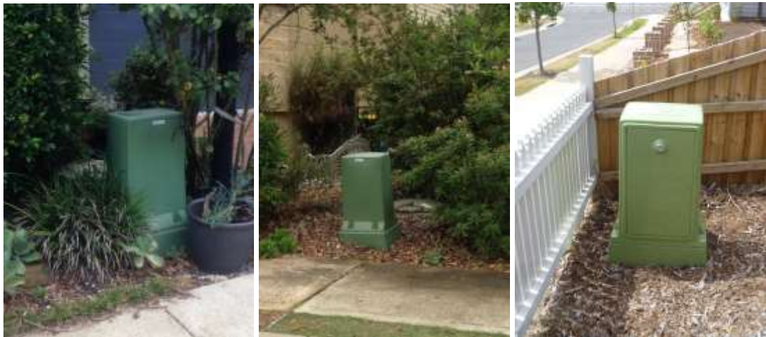
Figure 9.1 Example of Suitable landscaping arrangements

The control pillar will need to remain accessible at all times. No plants or shrubs can be planted in front of the control pillar door.